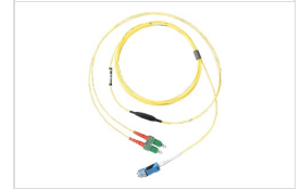
Uniboot Duplex Patch Cord with flexiFanout Duo