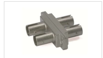
ST (BFOC/2.5) duplex adapter