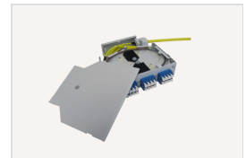
Splice box for top-hat rail mounting