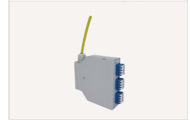
Splice box for top-hat rail mounting, closed