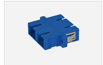
SC duplex singlemode adapter