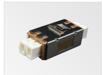
MU duplex adapter