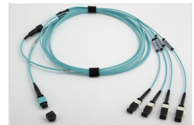
MPO assembled to fanout cable