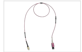
Duplex patch cable (jumper cable)