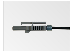
HFBR simplex with latching