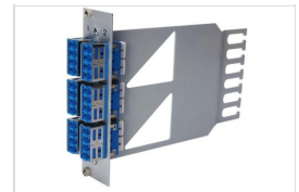
Fiber Optic Patch Module