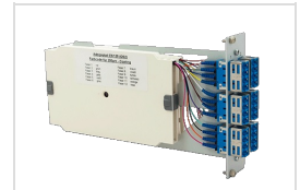
Compact Splice Module Twin short LC