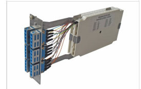
Compact Splice Module Twin LC