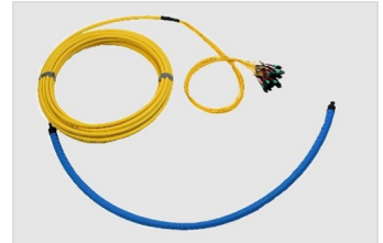
Breakout cable with strain relief and protection element