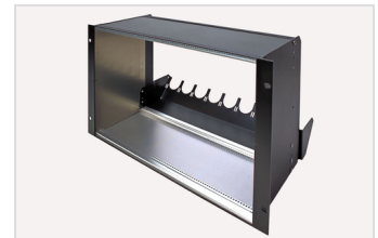
19" subrack, modular 6 U with trunk cable holder