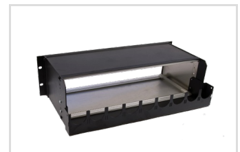
Rear view 19" subrack, modular 3 U with trunk cable holder 90°