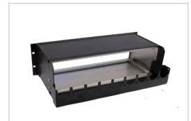
Rear view 19" subrack, modular 3 U with trunk cable holder 90°