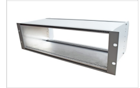
19" subrack 6U RAL7035