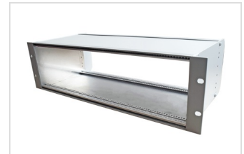
19" subrack 6U RAL7035