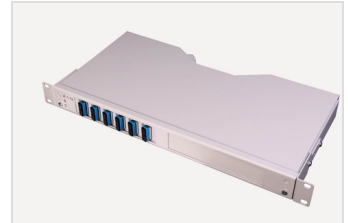
19" FO splice box version 215, with angular adapters