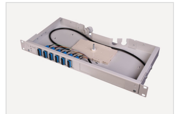
19" FO splice box version 215, with angular adapters, open