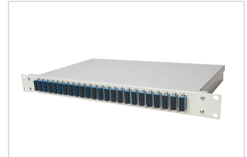
1 U splice box