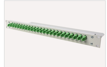
1 U, patch panel, equipped with E-2000 adapters