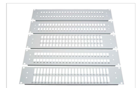
2 U front panel