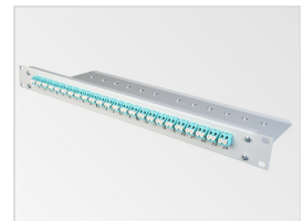
1 U, patch panel, equipped